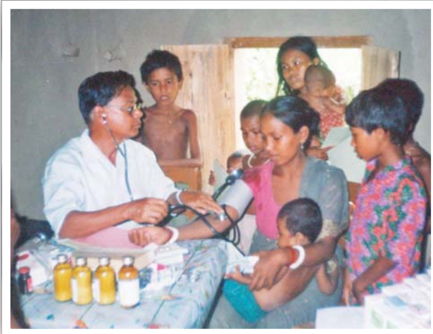
Indigenous missionaries in Bangladesh give medical help to needy people.

Indigenous mission groups worldwide have an estimated combined total of more than 200,000 pioneer, church-planting missionaries now on the field or ready to go. Many of them have little or no financial support. Intercede International finds sponsors who will send $50 to $100 per month or more for one missionary. The work of these missionaries becomes much more effective when