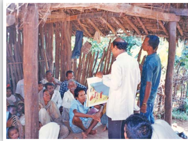
Above: An indigenous missionary teaches truths from the Bible in India.

Several thousand indigenous mission groups are now active for the Lord in Asia, Africa, Eastern Europe, and Latin America. They have a combined total of more than 200,000 missionaries either on the field or ready to go. Basic support for one of these workers averages from $50 to $200 per month.