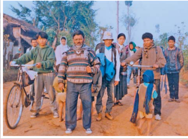
Indigenous missionaries in Nepal are ready to go to a mission field.