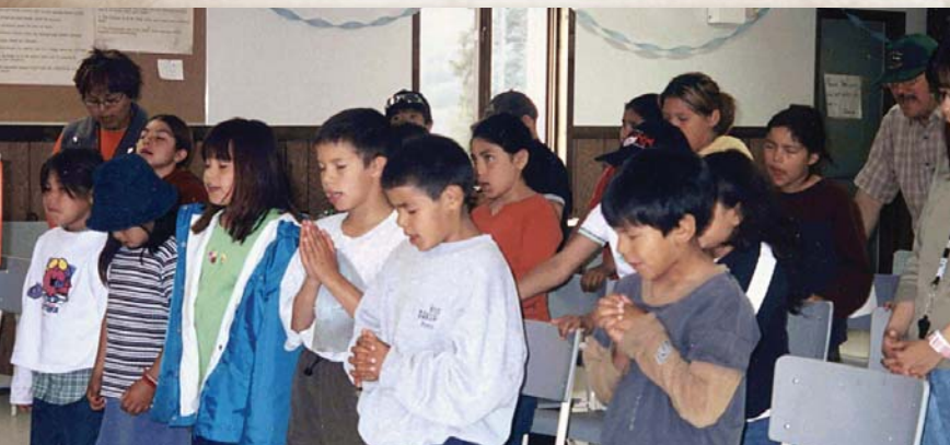
BELOW: Young campers and counsellors pray together at Camp Ohahaseh.