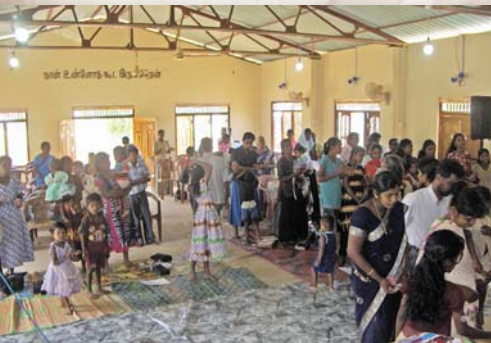
ABOVE: Sri Lankans worship the Lord at an MMS church.